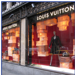
Louis Vuitton at Saks Fifth Avenue