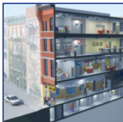
Manhattan Neighborhood Network