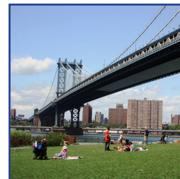
Brooklyn Bridge Park