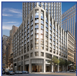
Setai Fifth Avenue Hotel