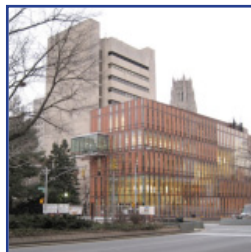
Barnard University Student Center