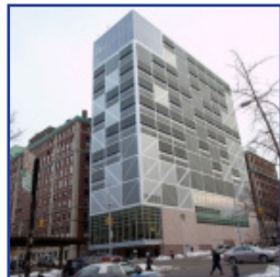
Columbia University Northwest Science Center