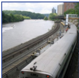
Hudson Lines Station Improvement